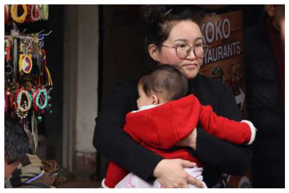
और घर के अनिगनत कामों के बीच संतुलन बनाने में एक गृहिणी का पूरा दिन बीत जाता है। और इतना करने के बाद भी अक्सर कुछ न कुछ बाकी रह ही जाता है।

जहां एक ओर पारिवारिक संतुलन के लिए यह सकारात्मक संकेत है कि, पित और पन्नी आपस में कार्यों को विभाजित कर लें। वहीं दूसरी ओर अभी भी गृहणियों के योगदान को उचित महत्व नहीं दिया जाता। अपने बच्चे के विकास को करीब से अनुभव करना बहुत संतोषजनक होता है। पर दिनभर बच्चे की देख-रेख और अकेले घरेलू काम करने से अक्सर उनके जीवन में सामाजिक अलगाव की स्थित आ जाती है।